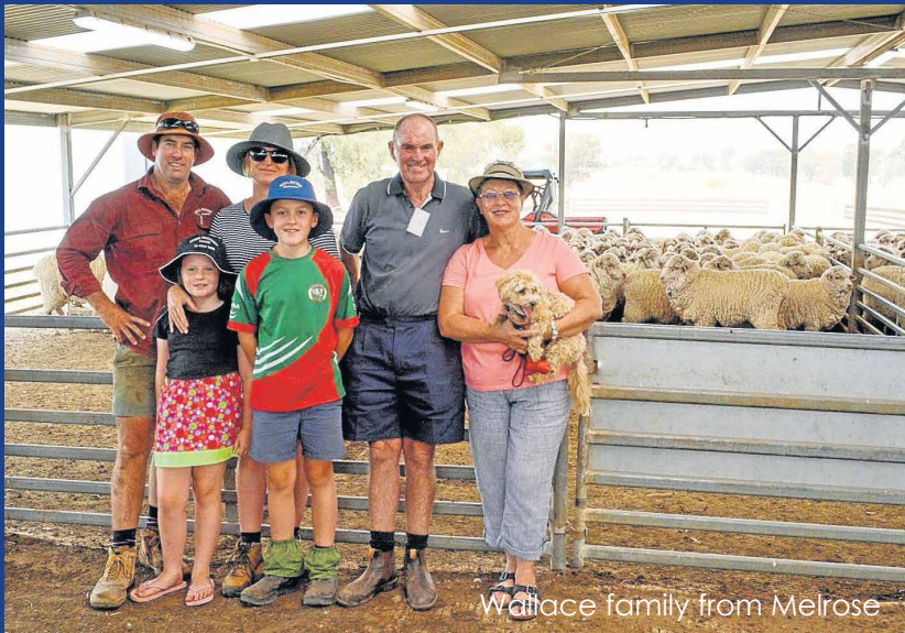
Wallace family from Melrose