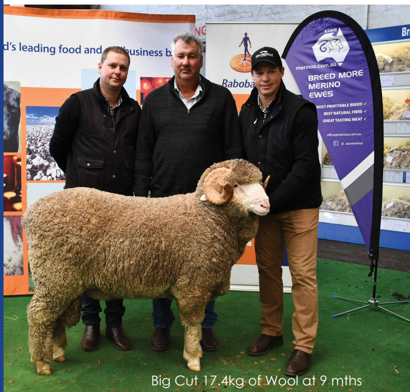
Big Cut 17.4kg of Wool at 9 mths

Semen has been sold to NSW, VIC, SA, WA & New Zealand with almost 2,000 ewes joined to Gladiator. We performed an AI and the ET program plus natural joining to 400 ewes. With the lambs ready to wean they look very promising.